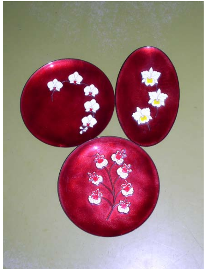
Mickey Nax's cloisonné plates