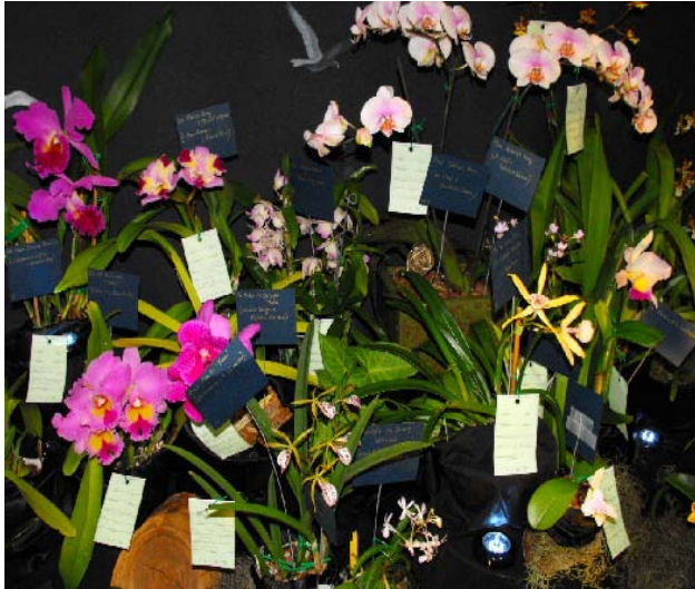
Note the use of the Mid-America registration tags!